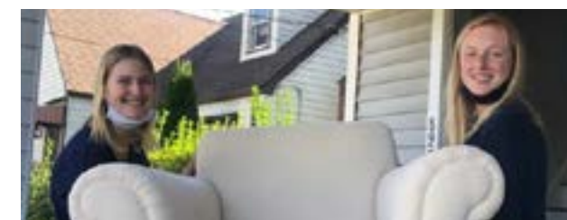
FAIRFIELD STUDENTS RALLY TO SUPPORT AFGHAN REFUGEES