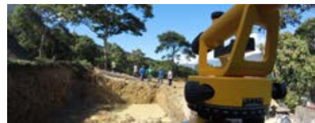
STUDENT ENGINEERS BUILDING FOR A BETTER FUTURE

The Response to the Cry of the Poor is a call to promote eco-justice, and to be aware that we are called to defend human life from conception to death, and all forms of life on Earth. Recommended actions include projects to promote solidarity (with special attention given to vulnerable groups such as indigenous communities, refugees, migrants, and children at risk), analysis and improvement of social systems, and social service programs.