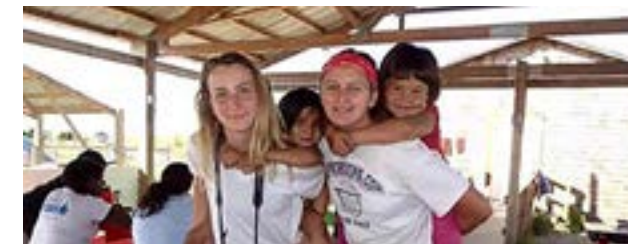
7TH BIENNIAL JUHAN CONFERENCE BRINGS JESUIT SCHOOLS TOGETHER

The Center for Social Impact received a $90,000 grant from the Switzerland-based Benina Foundation to strengthen its partnership with Loyola High School in Dar es Salaam, Tanzania. The grant enabled four teachers and 10 students, many of whom are immigrant and refugee youth, from the Jesuit high school to visit Fairfield in the summer of 2023 and take STEM classes in chemistry and cybersecurity.