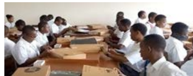
TANZANIAN STUDENTS LEAN INTO STEM PROGRAMS AT FAIRFIELD

A 2023 multidisciplinary faculty panel discussion was hosted in connection with the annual Worldwide Teach-In on Climate and Justice, organized by Bard College. Teach-in events are held globally to generate thoughtful input from educators, students, faith leaders, and community members who are deeply concerned about climate change, climate justice, and the future.