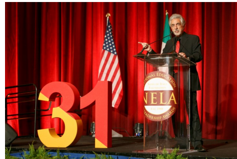
From the 2019 NELA Gala: (L) 2019 National Leadership Grant Recipients; (R) Master of Ceremonies Joe Mantegna