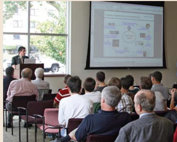
Area industry leaders address the freshmen at a fall workshop.

e-portfolios by all students, which will provide opportunities for reflective thinking and writing, and for nurturing their communication skills.