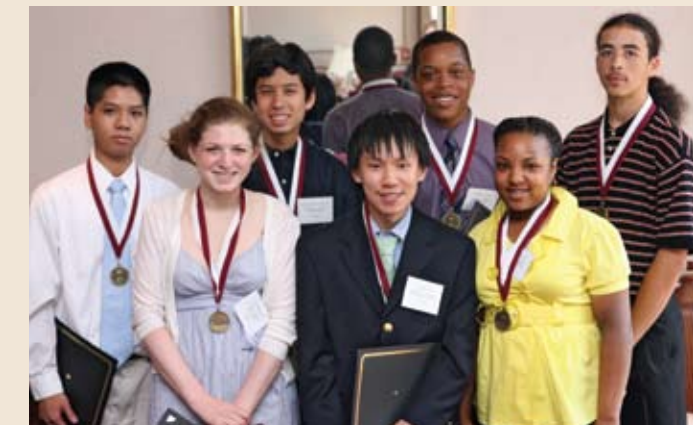
Students from Bridgeport area high schools received medallions and certificates at the 2008 Excellence in Mathematics and Science Awards.

Hitchcock agreed, noting, "I'm looking at you and see the faces that will lead our industry one day... Some of you will make significant discoveries that will touch peoples' lives."